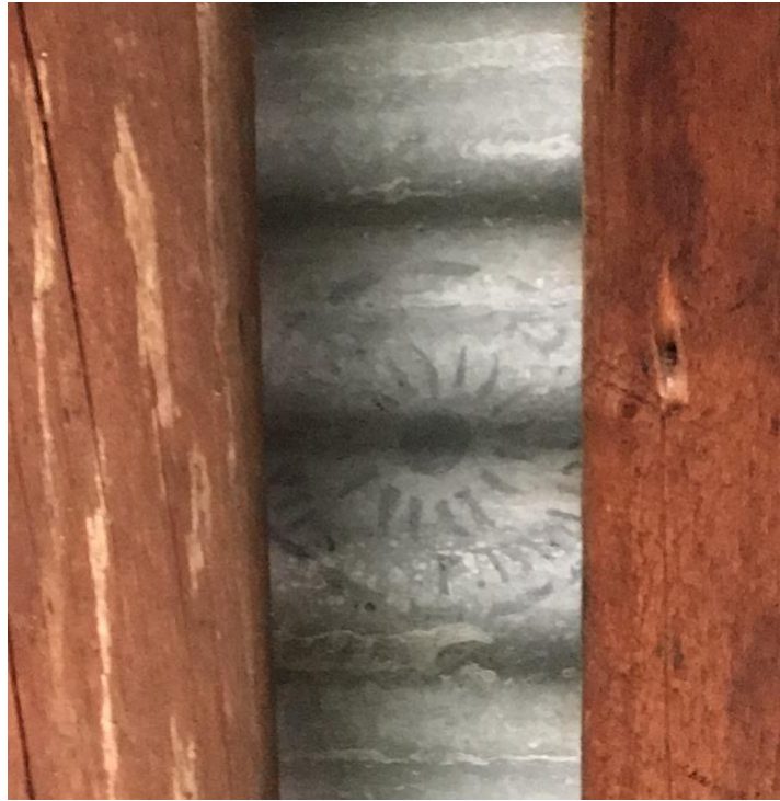
Staley Crown Pastorie at Elands Kloof