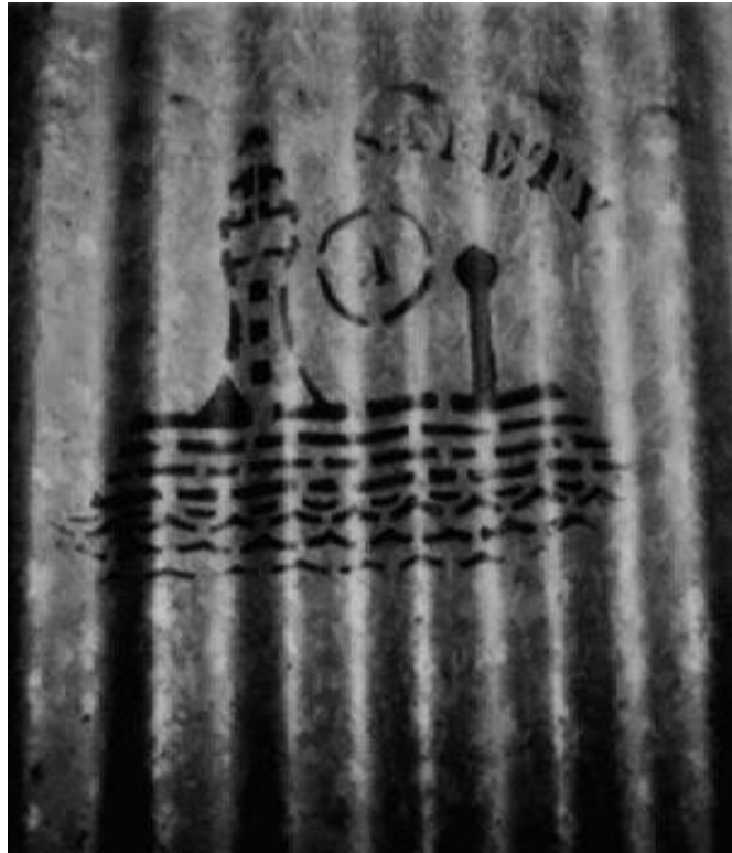
Emu Brand - Wolverhampton Corrugated Iron Co La Cotte, Franschhoek