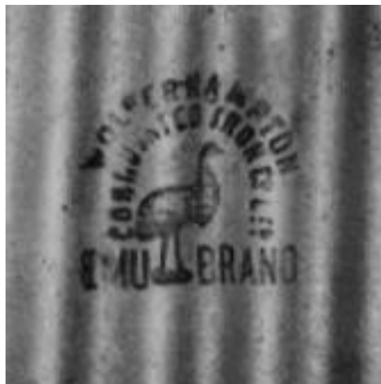
Sun Brand Moolkelder, Paarl, Western Cape